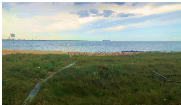
Path 2 Beach