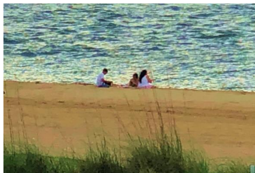
Enjoying the Beach