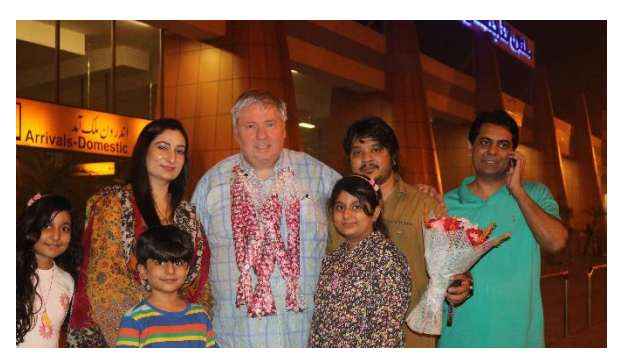
The welcome in Multan

There is so much more to say concerning this mission trip, and I am grateful to the Water's Edge congregation for whetting my appetite for missions by allowing me to travel to Honduras with them twice. I will be sharing some stories in person when God allows me opportunity, but for now, please see some of the pictures from this trip on the last three pages of this COGVA News.